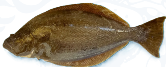
California Flounder / California Halibut Paralichthys Californicus