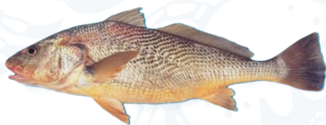
YELLOWFIN CROAKER Umbrina Roncador