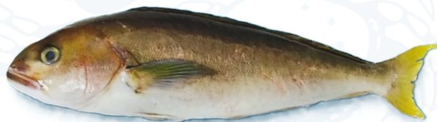
Ocean Whitefish Caulolatilus Princeps