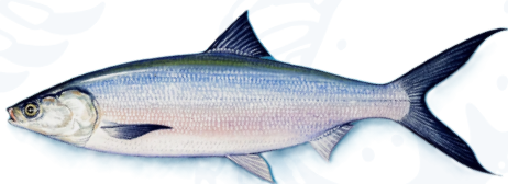
Milkfish Chanos Chanos