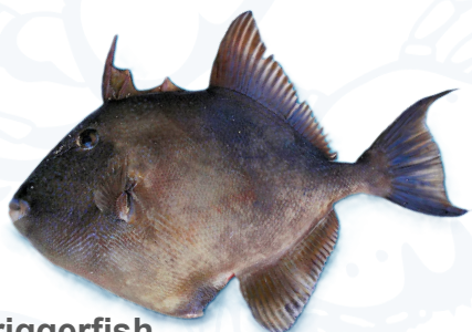
Triggerfish Balistes Polylepis