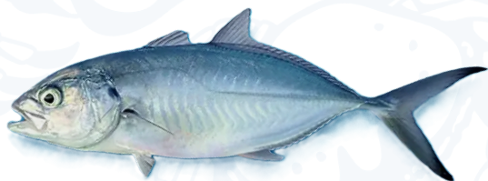
Blue Runner Caranx Crysos